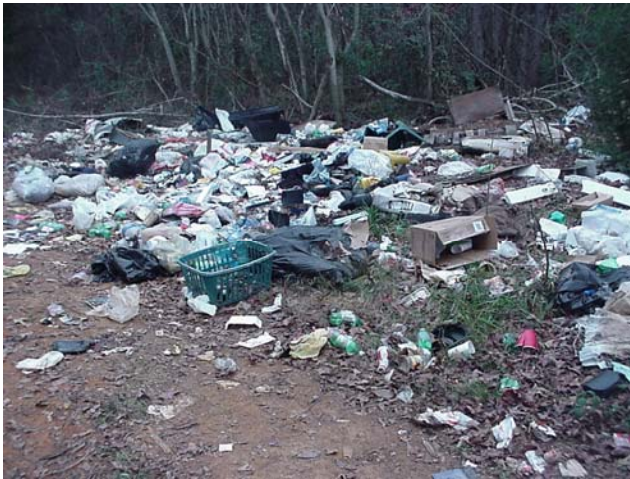
Improper disposal causes poor water quality and is unlawful in Jefferson County!

Improper disposal occurs when people do not properly discard trash, yard and household chemicals, debris, and other materials that they do not want. Instead, they improperly dump it in a location where it comes in contact with stormwater and enters the storm drain system. Local ordinances prohibit dumping.