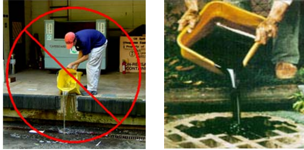
Pouring dirty wash water or used motor oil into a storm drain grate is an illicit discharge

An illicit discharge is anything besides stormwater that enters the storm drain system. It can be intentional or unintentional, but it is illegal for anything but stormwater to enter the storm drain system. A few exceptions to the law are listed in this brochure.