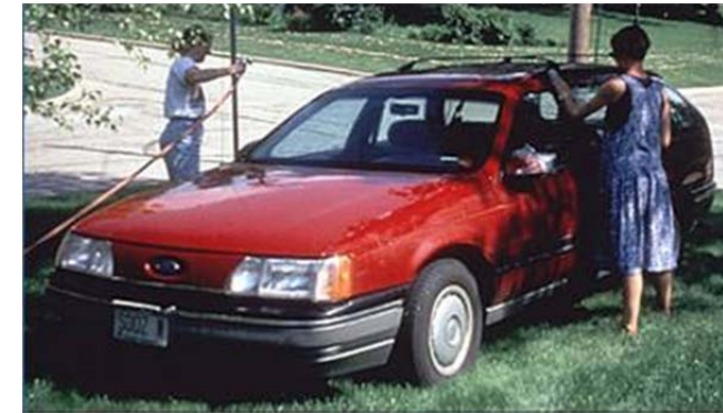
Washing the car on a grassy area allows wash water to soak into the ground, not enter a storm drain.