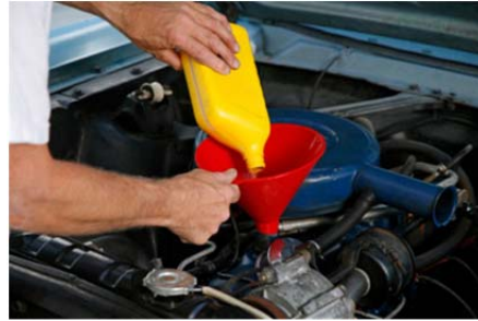
An estimated 180 million gallons of used oil is improperly disposed of each year!