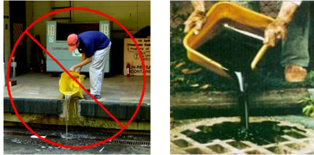
Pouring dirty wash water or used motor oil into a storm drain grate is an illicit discharge

An illicit discharge is anything besides stormwater that enters the storm drain system. It can be intentional or unintentional, but it is illegal for anything but stormwater to enter the storm drain system. A few exceptions to the law are listed in this brochure.