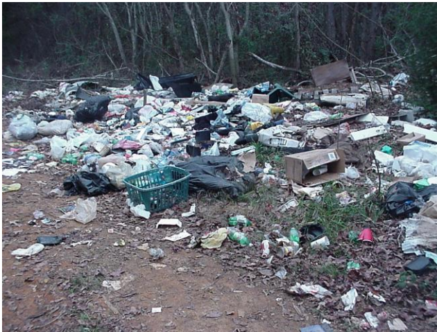
Improper disposal causes poor water quality and is unlawful in Jefferson County!

Improper disposal occurs when people do not properly discard trash, yard and household chemicals, debris, and other materials that they do not want. Instead, they improperly dump it in a location where it comes in contact with stormwater and enters the storm drain system. Local ordinances prohibit dumping.