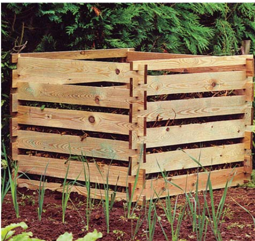
A compost bin is easy and inexpensive to build and will provide you free organic fertilizer!

Yard waste in the storm drain system causes many problems for our communities. Debris placed or washed into a storm drain can cause flooding; damage to the system if caught in culverts or pipes; and create algae blooms, fish kills and unpleasant odors as it decomposes in water.