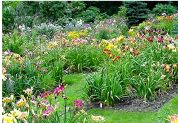
You can grow a beautiful yard and garden and still do your part to protect water quality in waterways!

A green lawn and blooming garden make your home more beautiful and increase your property value. Using fertilizers, pesticides and weed killers are a great way to help you achieve this look, especially when you read and follow the package directions. However, using too much of a lawn and garden product or not correctly disposing of any excess can turn helpful products into harmful pollutants if they enter local waterways.